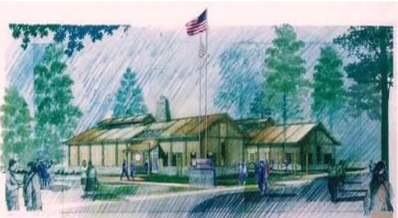
Cheroenhaka (Nottoway) Indian Cultural Center & Museum